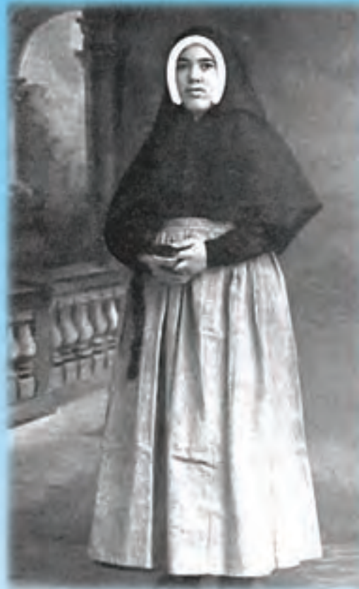
Sister Lucy as a young nun.

Remember to be like Sister Lucy, Jacinta, and Francisco, and make many sacrifices to console God and the Immaculate Heart of Mary, and to save poor sinners from Hell. Pray often to Our Lady for the Consecration of Russia, because, only by this act of obedience, will there be given a period of true peace for all mankind.