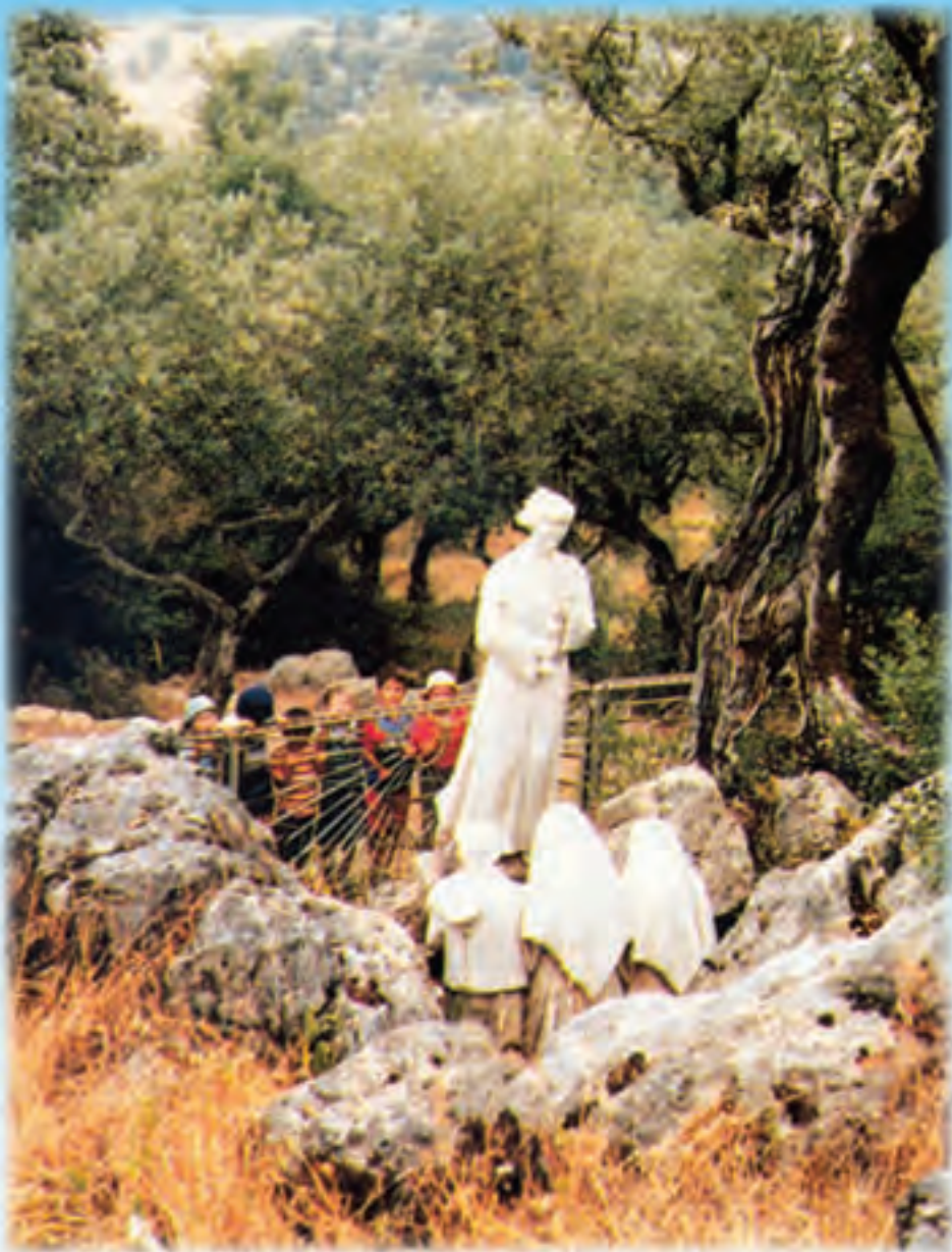
Actual site where the Angel of Peace appeared in 1916 to the three children in Fatima, Portugal.